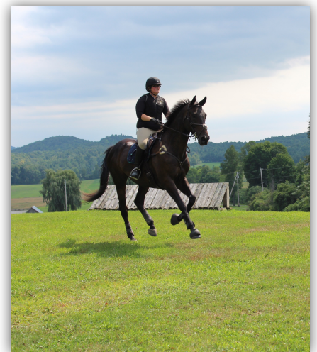
My horse Chief Contender and I schooling x-country at High Wind Farm this past summer.

Support us every time you shop using Amazon Smile!